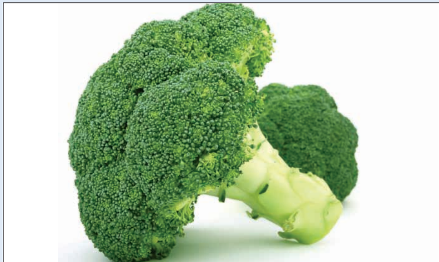
RFA-OD-001 supports research on foods of plant origin such as broccoli.

The National Cancer Institute (NCI), the National Center for Complementary and Alternative Medicine (NCCAM), and the Office of Dietary Supplements (ODS) have released RFA-OD-09-001, titled “Dietary Supplement Research Centers: Botanicals (P50).” The purpose of this Request for Applications (RFA) is to promote collaborative interdisciplinary study of botanicals, particularly those used in dietary supplements. This initiative is intended to advance the spectrum of botanical research activities, ranging from plant identification and characterization to early phase clinical studies.