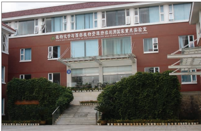
KIB's State Key Laboratory of Phytochemistry and Plant Resources

In July 2008, the United States government signed a research agreement with China to foster collaboration between researchers studying integrative and Traditional Chinese Medicine (TCM) in both countries. One of the first and most promising of these projects is a partnership between the Kunming Institute of Botany (KIB) of China Academy of Sciences and two groups at the National Cancer Institute (NCI).