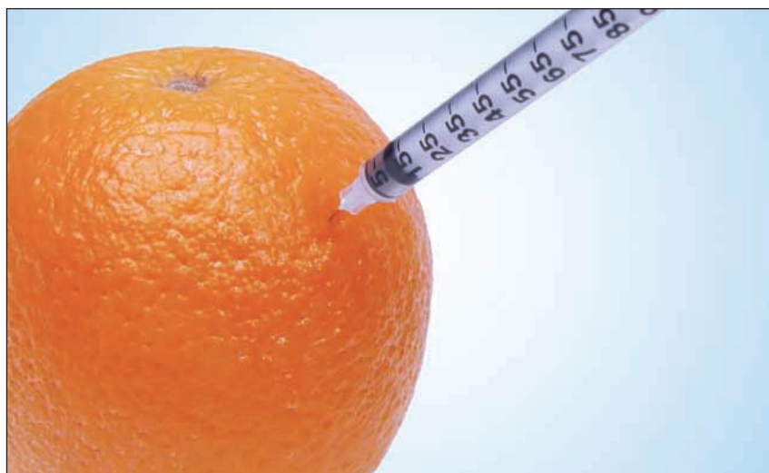
Researchers Debate the Role of IV Vitamin C as a Cancer Treatment

Vitamin C is commonly known to be essential to human health. However, specifically as it relates to cancer treatment, the value of vitamin C is debated and often considered a topic of scientific controversy. Cancer researchers have investigated various ways of administering high-dose vitamin C, including both orally and intravenously. Researchers have also examined different forms of vitamin C—ascorbic acid (AA) and dehydroascorbic acid (DHA)—which may well be a comparison of apples and oranges.